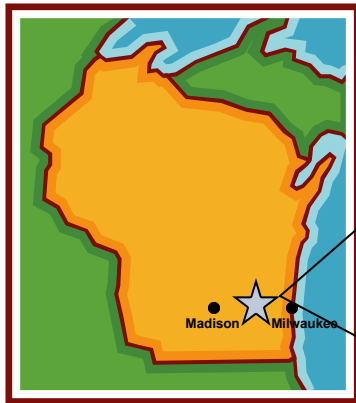
Map of Wisconsin